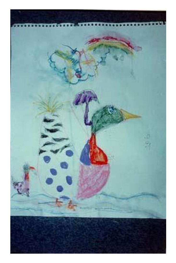
Figure 2. A Once Upon a Time Fairy Tale Drawing or Painting

kingdom where there was a hurricane (flood, earthquake, etc.)" and then let your child fill in the rest of the story by drawing or painting images of what your child thinks happened in this kingdom. Encourage your child to put animals and imagined or real characters in the drawing or painting.