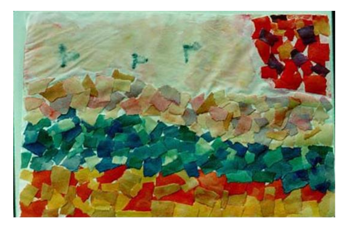
Figure 4. Making a Picture by Tearing Up and Gluing Pieces of Paper