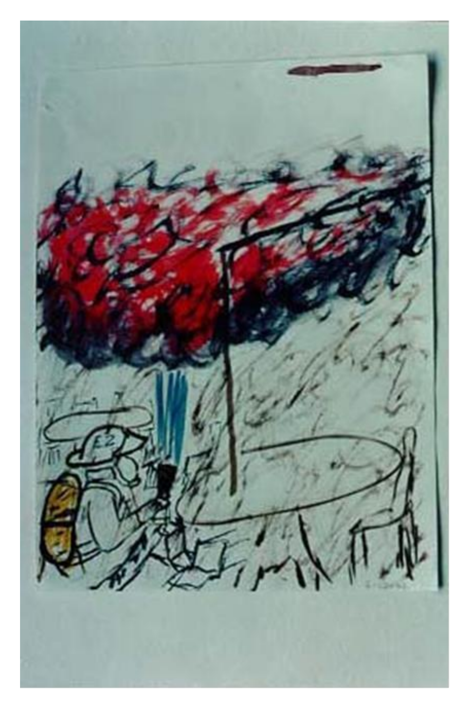
Figure 3. Helpful Characters in the Fantasy Kingdom

triangles can be used. You can also make a 3-D Play Doh or paper mache sculpture of a guardian spirit or a protective character (see Figure 5).