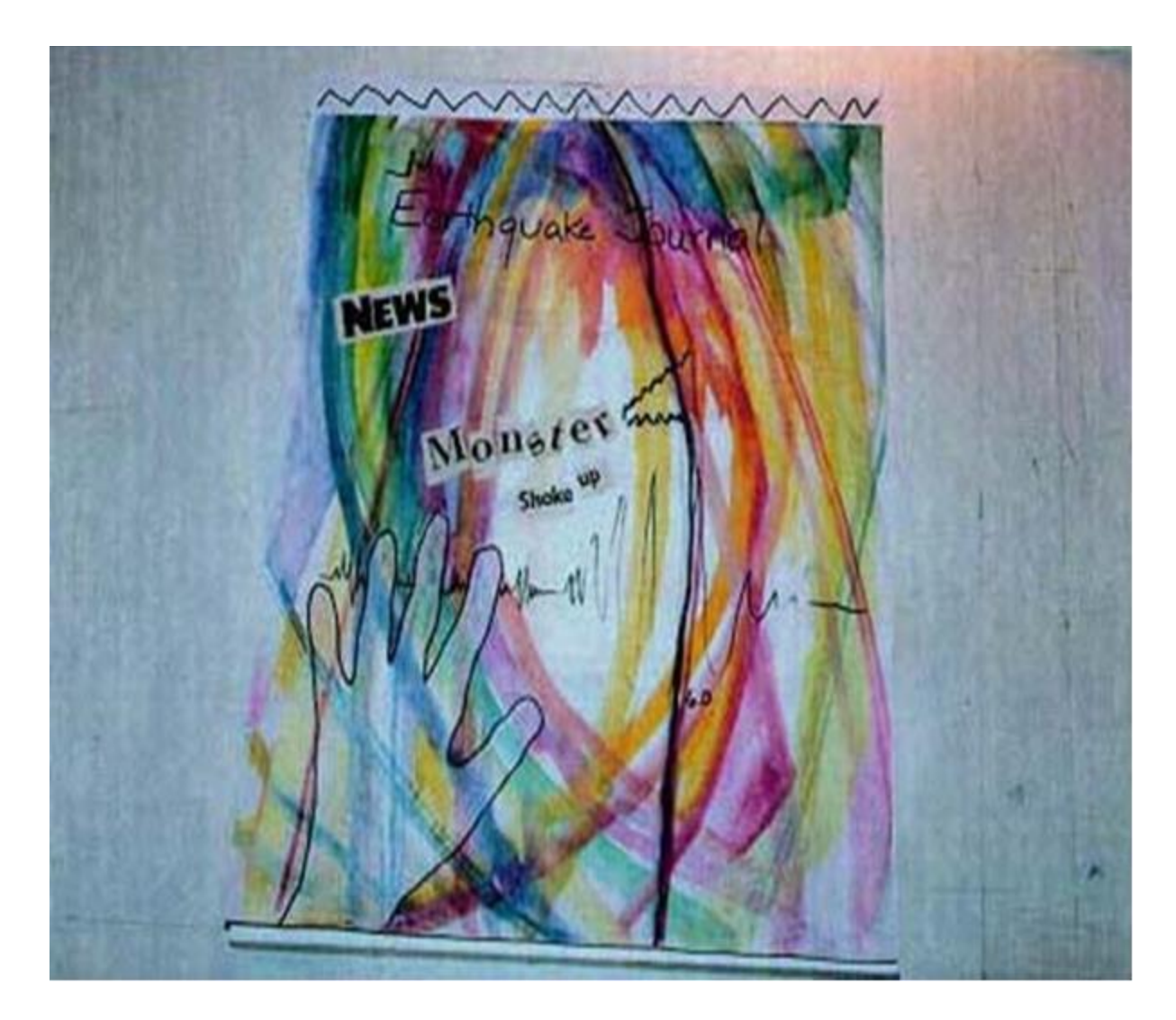
Figure 6. A Disaster Art Journal

reducing ways. Active participation in art helps put a temporal perspective on personal experience. For example, a drawing about a disaster is something about an event that happened in the past and it allows us a chance to see in a concrete, visual way that, in fact, the stressful event is over. It allows children to go on to consider what life will be like for now and in the future. Allowing children to do the natural work of childhood by creating in art media, by building up and tearing down, by constructing and exploring, by interpreting with their hands and their eyes, permits them to express their physical and emotional world. Art is a great idea for anyone, and easy to do at home. And we suggest that it's a lot of fun!