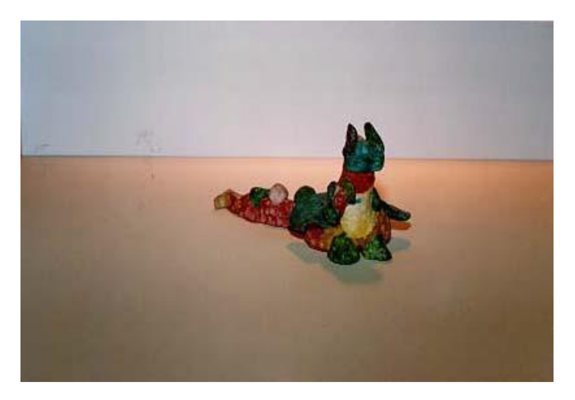
Figure 5. 3-D Guardian Spirit or Protective Figure

be put in about ideas they have had about the disaster. Another section could include ways the world is being put back together in a positive direction. For instance, how people help each other and ideas that your child might have for ways that they can help their family or others. Another section of the art journal could be called "wishes". This could include drawings or lists of wishes that the child has for himself or herself, for the family, or for other people that your child has heard about or knows. Another section could be maps or safety routes of the house, of ways to stay safe and of plans that can be made to stay safe in situations such as a disaster.